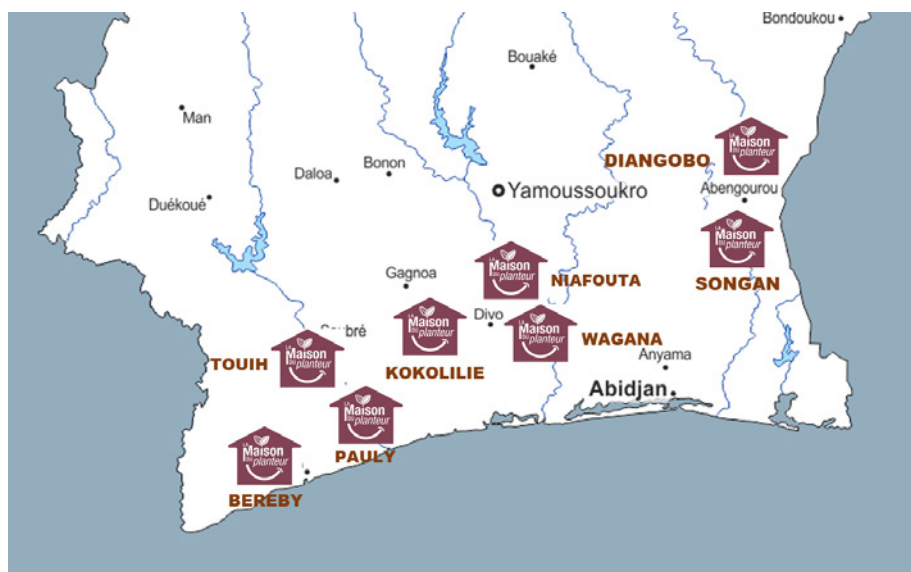
Figure 1. Transparence Cacao – Fermentation centres ( maison du planteur ) in Cote d'Ivoire

In Côte d'Ivoire, the Transparence Cacao programme is implemented together with 55,200 farmers, who are members of 92 cooperatives; they form CÉMOI's entire supply chain in the country (Figure 1). The programme involves other key actors and is based on four pillars: food quality and traceability; aromatic quality; farmers' quality of life; and environmental quality. The fourth pillar includes tackling cocoa related deforestation and promoting responsible cocoa and agroforestry.