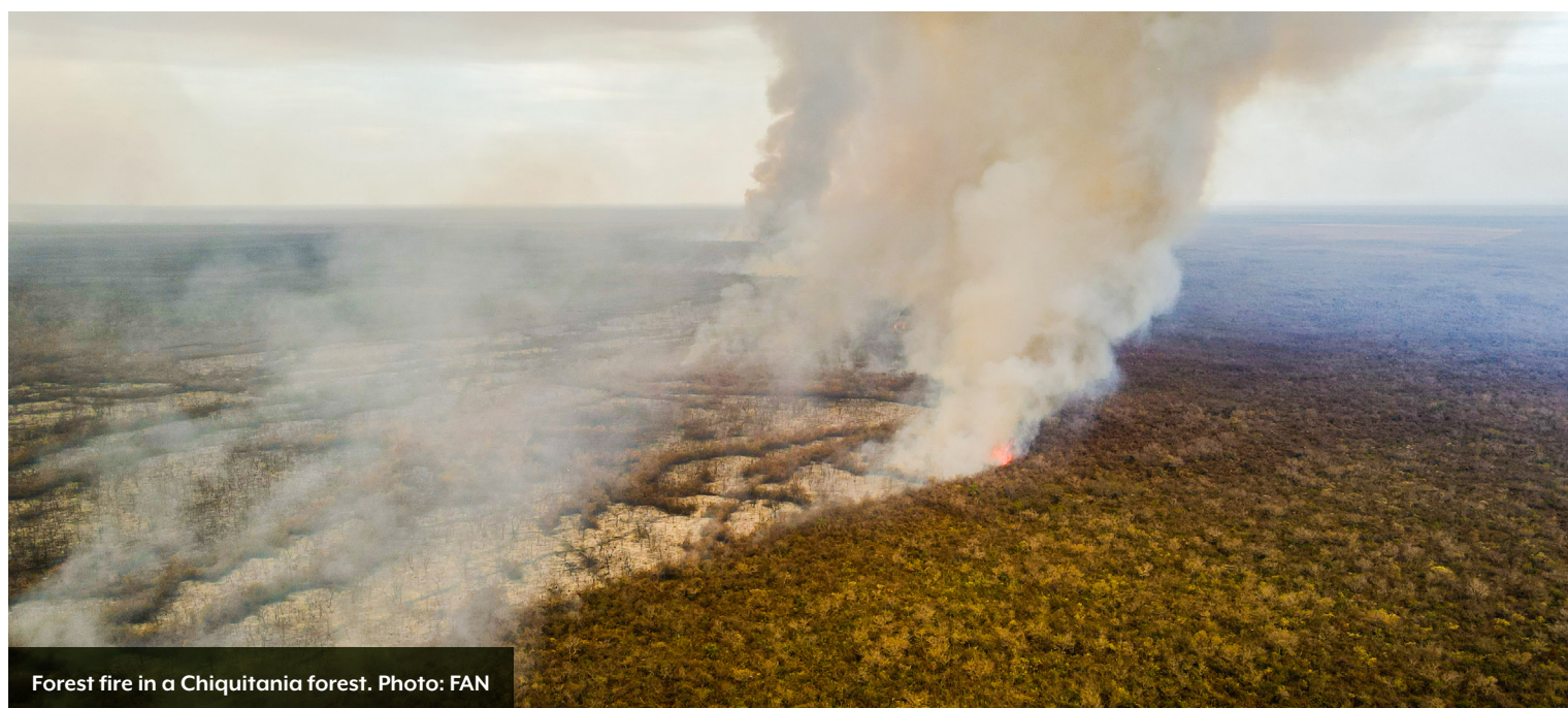
Forest fire in a Chiquitania forest.

Communities actively participate in management and monitoring, supported by geospatial tools and information and communication technologies. Through participatory mapping exercises using high-resolution drone and satellite imagery, local people study and analyze their territory, establishing a zoning system for sites of great importance to conservation, protection