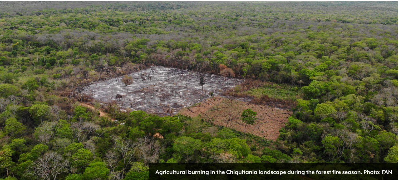
Agricultural burning in the Chiquitania landscape during the forest fire season.

The main causes of fires in Bolivia are associated with agriculture and livestock farming, by both small and large producers. In indigenous communities, the use of fire is mainly related to clearing small productive plots and renewing fallow land, and in livestock activities and hunting, where it is a traditional practice that incorporates knowledge of local conditions. Fire is also widely used in large-scale livestock farming for pasture renewal and pest control, and in mechanized commercial agriculture to clear large tracts of land, which in many cases can cause forest fires. This is compounded by the increasing pressure of human settlements on forested areas, by regulations and development plans that favour land conversion for agriculture, and by the impacts of climate change.