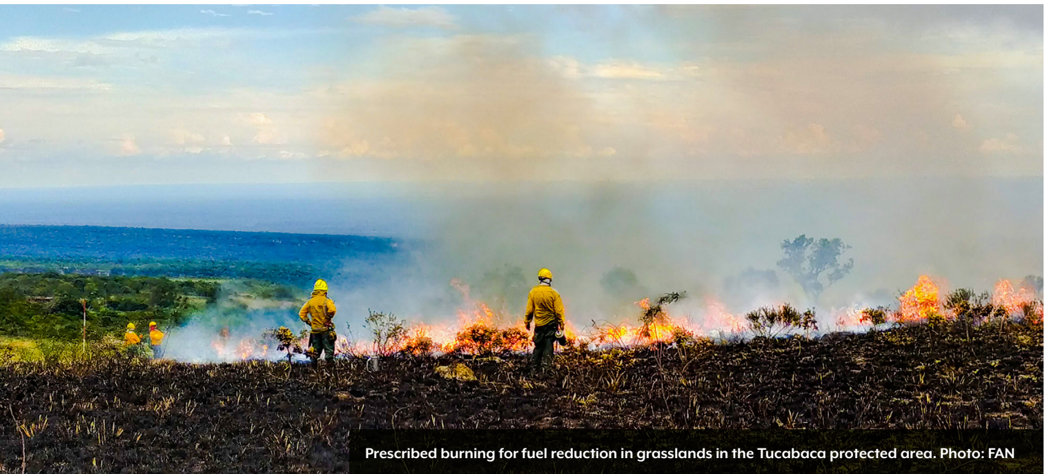
Prescribed burning for fuel reduction in grasslands in the Tucabaca protected area.

and production. They also assess fire risks in order to improve land-use and fire management planning and management in a way that considers their livelihoods. Information on land use, production systems, fire-use practices and fire risks is recorded through the use of smart phones and mobile applications. Each community in the programme's pilot areas has dedicated fire management delegates who are trained and equipped to register georeferenced field data in digital formats designed for this purpose. They also monitor data and coordinate with community members to inform and support decisions and action planning related to land use and risk reduction. In this way, communities are provided with information and monitoring tools to guide the management of their territory in a more efficient and sustainable way.