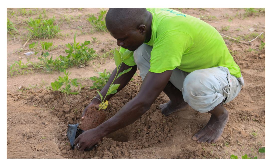
A farming planting a baobab ( Adansonia digitata ) seedling in his farmland in Kaffrine, Senegal.

Another innovation is Seedballs Kenya, pioneering a method for efficient and low-cost reintroduction of tree and grass species into degraded areas in East Africa [(ii)]. Seeds of native trees and grasses are coated in waste charcoal dust mixed with nutritious binders, which protects them from predators until rains arrive, and encourages germination. Spread by hand, slingshot, crop-spraying planes, helicopters or drones, for as little as US$0.05 per established seedling, this greatly reduces costs compared to planting seedlings.