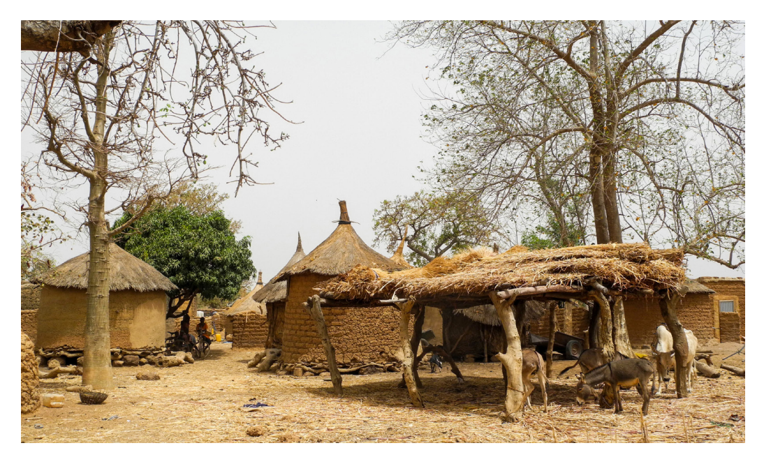
Village in Gourcy province, Burkina Faso that has benefitted from dryland restoration..

decide to invest their scarce resources in restoring the productivity of their land, restoration of African drylands will remain an unrealized ambition – just a dream. For example, it is essential to communicate that investing local labour in FMNR, planting pits, half-moons or contour stone bunds can yield significant benefits from as soon as the first and second year, with increased crop yields and firewood and leaves for fodder or to enrich the soil from thinning and pruning emerging saplings.