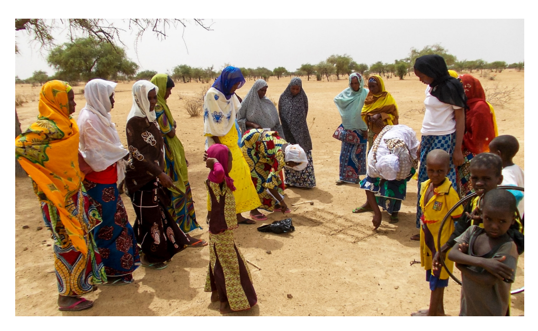
Training in tree establishment techniques for women in Rigal Saude, Niger.

determining who does what, who makes which decisions, who has access to resources and who benefits from restoration initiatives. An excellent analysis in Burkina Faso [3.3] analyzes gender differences and inequalities in rights and responsibilities, and sees that women find innovative ways to participate, such as collective action and mutual support groups. Ultimately, however, it is the quest for land security and economic opportunities that drives improvements to women's living conditions and their engagement. Other projects promote youth involvement in restoration, such as in Ethiopia, where youth are now leasing and managing nurseries and plantation sites, giving them control over the forests they are planting [(vii)].